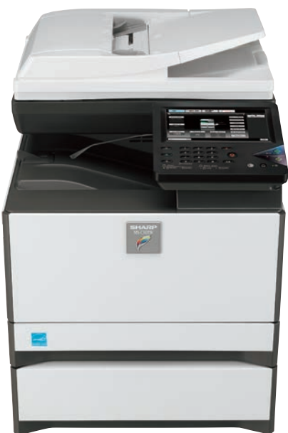
Shown with optional paper drawer.